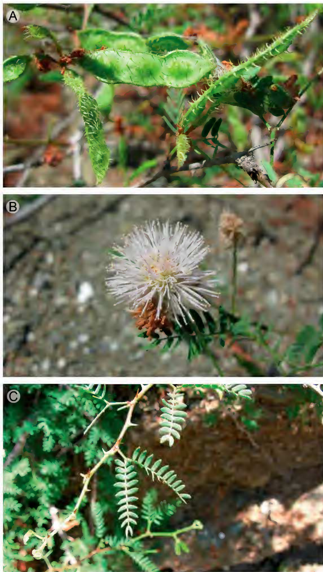
Fig. 2. Mimosa margaritae . A. sparsely setose legumes; B. flowers arranged in a capitulum; C. prickly branchlet with leaves.